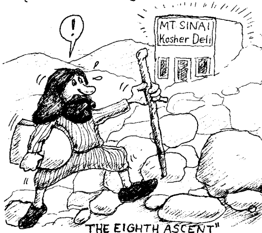
Moses - The Lawgiver - Overbey '77