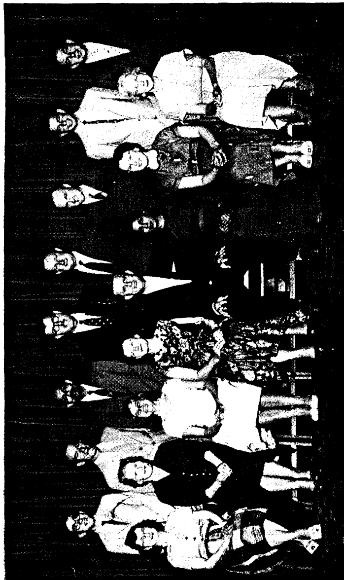
FOUNDATIONAL CLASS, VAN WERT, OHIO—JUNE 16-30