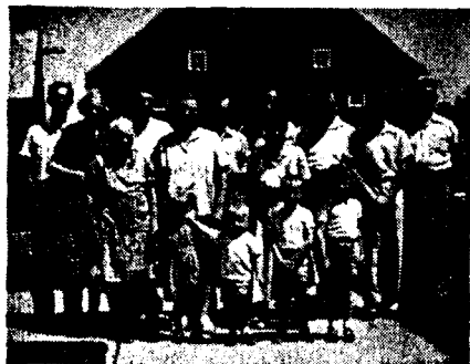
A group at The Way Farm, New Knoxville, Ohio. You might