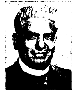
BISHOP K. C. PILLAI

and one-half inch thick, covered with linen. (We might call them pads.) Inside of these pillows are some kind of sacred roots which are from Tibet or the Himalayas, which are considered as having magical healing powers. These pillows have little straps on each end so that they can be tied under the arm pits or in front of the elbow.