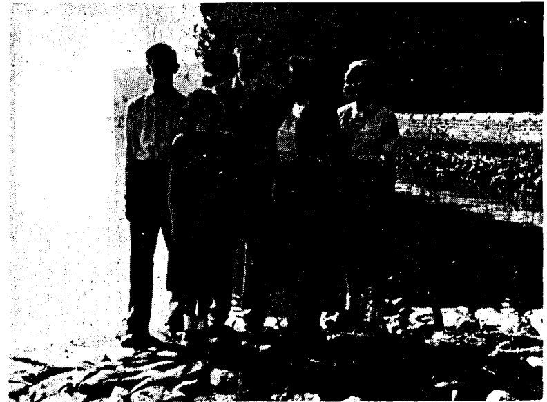
On the shores of the Sea of Galilee at Capernaum

In every land where we have traveled with the light of The Way ministry, which God by His grace has given us, we have endeavored to show people the greatness of the rights and privileges of every believer in Jesus Christ. We have found nothing but a most welcome reception in every land, and have been asked to return quickly or to send some one else who could teach and share more with them. Little can you realize the doors that have and are open for the Abundant Life, and the responsibility that rests upon us, as Christians, to meet these obligations. God has called us that we might meet the great challenge of the world in this day.