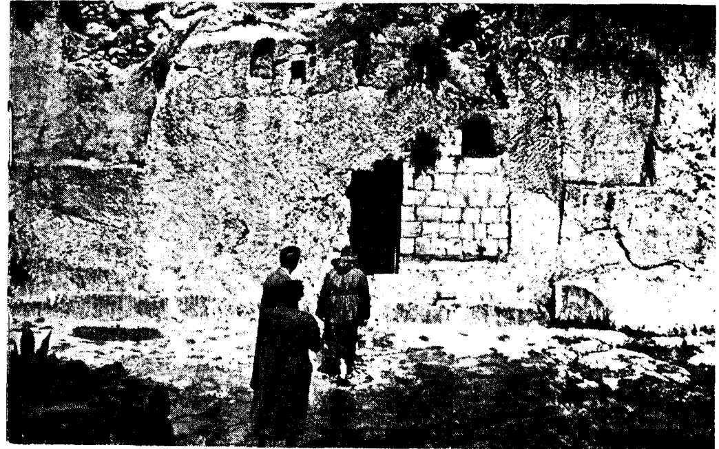
The Garden Tomb, Jerusalem, where Jesus was buried