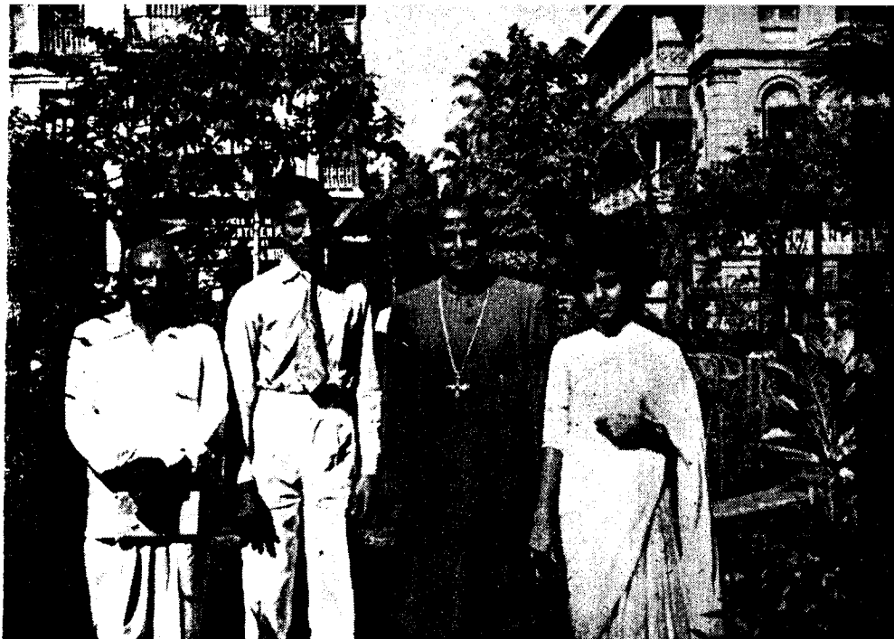
Picture B: In the garden at the Taj-Mahal Hotel the A.M. of our arrival, Nov. 8, 1955.

cials both in the Nation, State and Cities. We have been in the outlying Villages where the truest life of the Indian peoples can be seen and understood. In a later news letter after we have finished our complete Missionary Teaching and Training Tour we will publish for all who care to have a copy the full details of all our activities and findings. Ministering here in India has been the greatest opportunity God has so far opened unto us. Everywhere we go we have been so wonderfully received and the longer we stay the longer they desire for us to remain. This ministry of THE WAY will soon be reaching around the world bringing deliverance to multitudes.