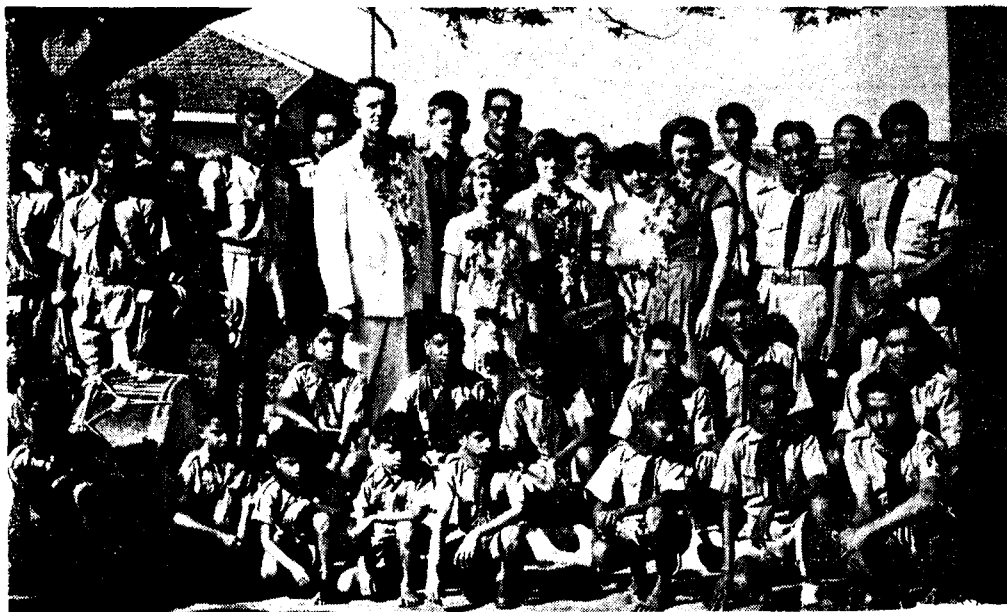
Boy Scout leaders band and reception group in part. Arrival Bombay.

I will share with you just one of the opportunities we have had so that you may rejoice with us, for others are in store. At Ujjain I was asked to be one of the two main speakers at the yearly convention of the Jains, an all-Hindu group numbering some three thousand at the convention. I was asked by them, the Hindus themselves, something no denominational missionary would perhaps find offered to them, to speak on The Abundant Life in Jesus Christ. Souls