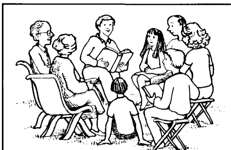
The sweetest thing this side of the gathering together

Thank You, Lord, for saving my soul, Thank You, Lord, for making me whole, Thank You, Lord, for giving to me Thy great salvation so full and free.