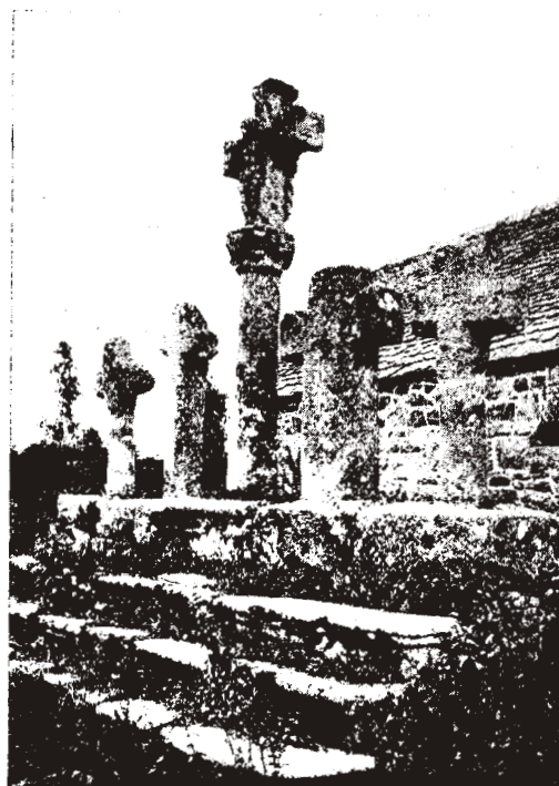
THE FIVE CROSSES AT PLOUBÉZÉRÉ, NEAR LANNION, Côtes-du-Nord, Brittany.

There are two words used of the "other" and "others" in John 19. 32 and Luke 23. 32 (see Ap. 124. 1). In the